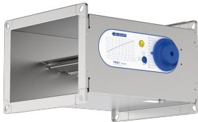
CAV CONTROLLERS TYPE EN-EX