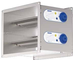
Unit with two controllers