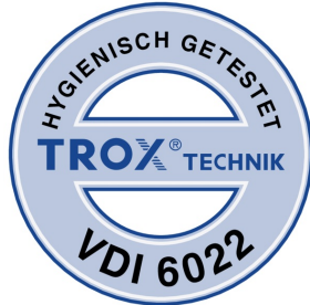
TESTED TO VDI 6022