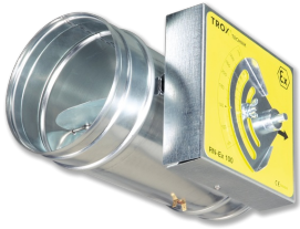
CAV CONTROLLERS TYPE RN-EX