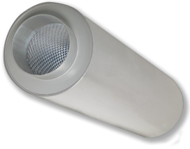
CIRCULAR SILENCER TYPE CAK