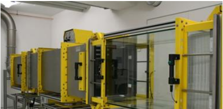
OR HIGHEST DEMANDS LTER TECHNOLOGY