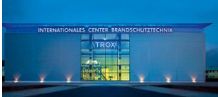
INTERNATIONAL CENTER FOR FIRE PROTECTION AND SMOKE PROTECTION