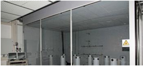
TEST FACILITIES AIR DISTRIBUTION TECHNOLOGY