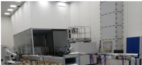
TEST FACILITIES CONTROL TECHNOLOGY