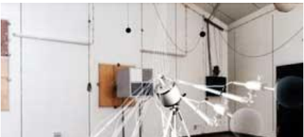
EASUREMENTS ON SOUND TENUATORS COUSTICS