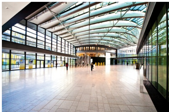
ADAC, Munich, Germany

Large and high reception areas require air terminal devices that can throw the air far into the room. Intelligent control systems ensure that the airflow is quickly adapted to uses of varying intensity and to varying climate conditions.