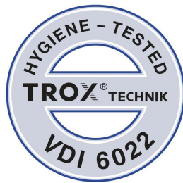
TESTED TO VDI 6022