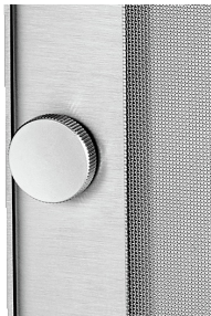
KNURLED SCREW FOR TOOL-FREE FASTENING