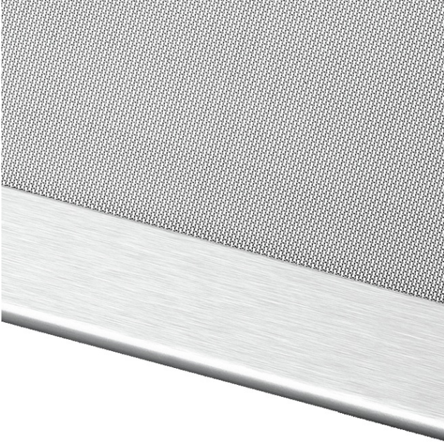
Knurled screw for tool-free fastening